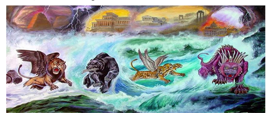
Daniel's Four Wild Beasts

Revelation 11:15 And the seventh angel sounded; and there were great voices in heaven, saying, the kingdoms of this world are become the kingdoms of our Lord, and of his Christ; and he shall reign for ever and ever.