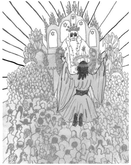
Son of Man Receiving the Kingdom